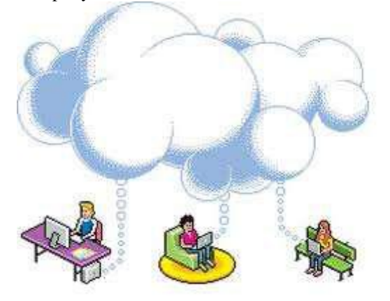
Fig 1: cloud architecture

Security in cloud computing can be addressed in many ways as authentication, integrity, confidentiality. Data integrity or data correctness is another security issue that needs to be considered. The proposed scheme [4] specifies that the data storage correctness can be achieved by using SMDS (Secure Model for cloud Data Storage). It specifies that the data storage correctness can be achieved in 2 ways as 1) without trusted third party 2) with trusted third party based on who does the verification.